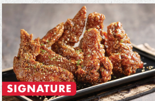
SOY GARLIC FRIED CHICKEN (4PCS / 6PCS) 8.9/11.5