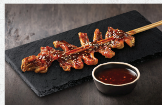
GRILLED SQUID SKEWER (SOY GARLIC / HOT & SPICY) 7.9