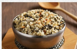
KIMGARU RICE 2.2