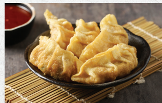
MANDU (SEAFOOD DUMPLINGS) (3PCS / 5PCS) 4.9/6.9