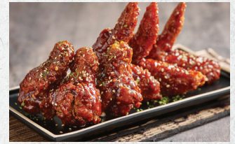
HOT & SPICY FRIED CHICKEN (4PCS / 6PCS) 8.9/11.5