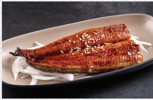
GRILLED UNAGI 12.9