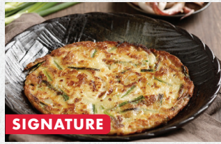
KOREAN PANCAKE (SEAFOOD) 8.9