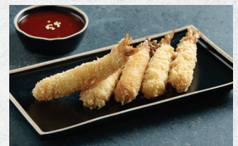
EBI FRY (3PCS / 5PCS) 6.9/8.9