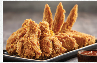
ORIGINAL FRIED CHICKEN (4PCS / 6PCS) 8.9/11.5