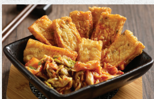
SEAWEED YUBA 4.9