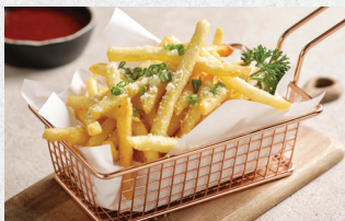
TRUFFLE FRIES 6.9 CHEESY FRIES 5.9