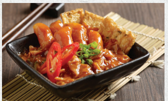
TTEOBOKKI WITH SEAWEED YUBA 4.9