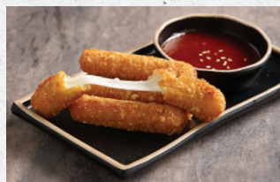
MOZZARELLA CHEESE STICK (5PCS / 8PCS) 7.9/10.9