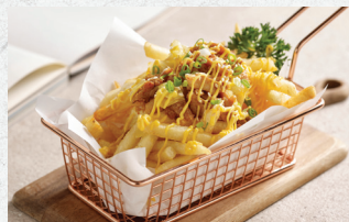
CHEESY FRIES WITH BULGOGI CHICKEN / BULGOGI BEEF 6.9