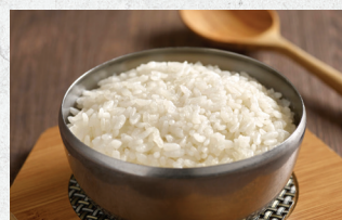
PLAIN RICE 1.2