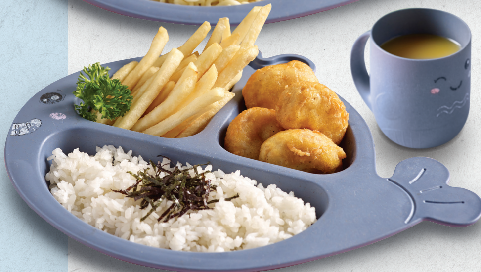
CHICKEN NUGGET & RICE SET