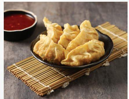
MANDU (SEAFOOD DUMPLINGS) (3PCS / 5PCS) 4.9/6.9