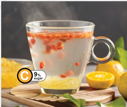
CITRON TEA 3.5