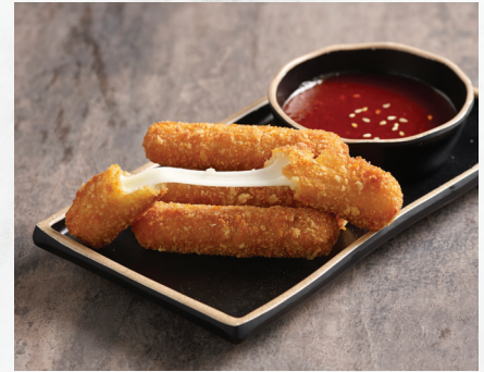
MOZZARELLA CHEESE STICK (5PCS / 8PCS)