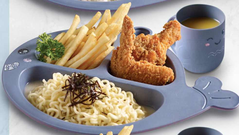
CHICKEN WING & NOODLE SET