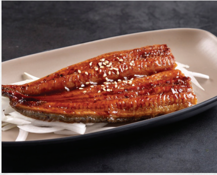
GRILLED UNAGI 12.9