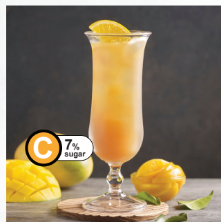
PEACH AND MANGO TEA 4.5