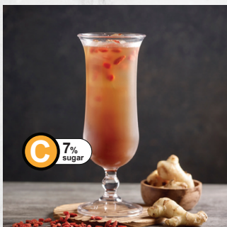
GINGER TEA 3