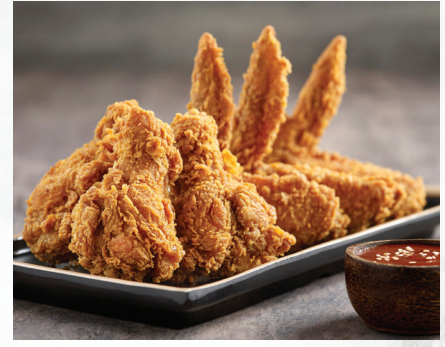
8.9 ORIGINAL FRIED CHICKEN (4PCS / 6PCS)