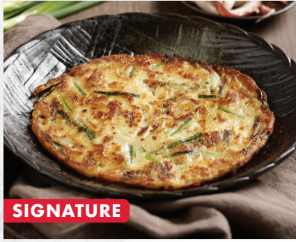
KOREAN PANCAKE (SEAFOOD)