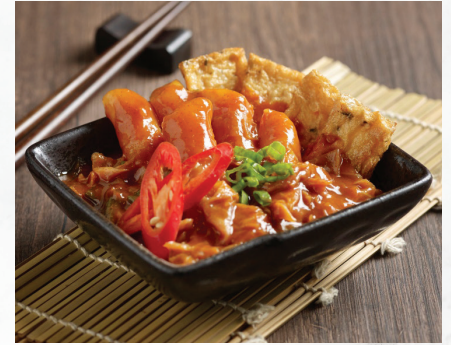
TTEOBOKKI WITH SEAWEED YUBA