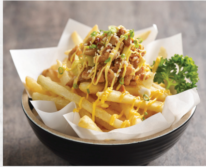
CHEESY FRIES WITH BULGOGI CHICKEN / BULGOGI BEEF