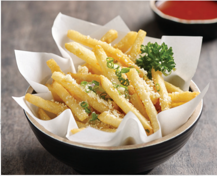
TRUFFLE FRIES CHEESY FRIES