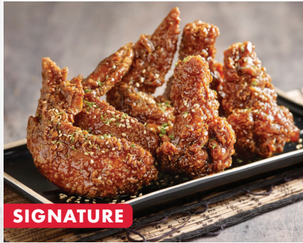
SOY GARLIC FRIED CHICKEN (4PCS / 6PCS)