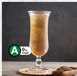
KOREAN BARLEY TEA 3