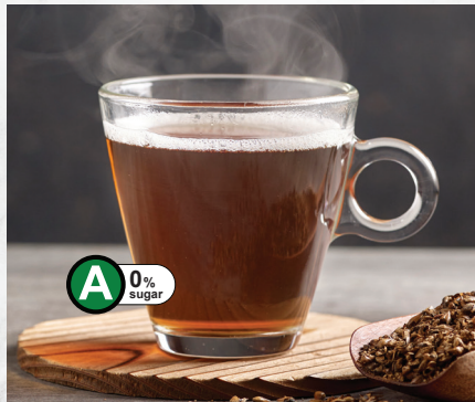
KOREAN BARLEY TEA