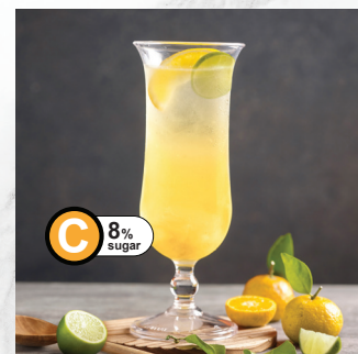
LIME TEA 4.5