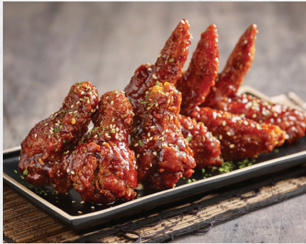
HOT & SPICY FRIED CHICKEN (4PCS / 6PCS)