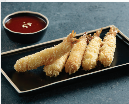
EBI FRY (3PCS / 5PCS) 6.9/8.9