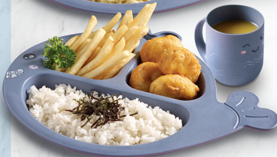
CHICKEN NUGGET & RICE SET