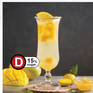
MANGO CITRON TEA 4.5