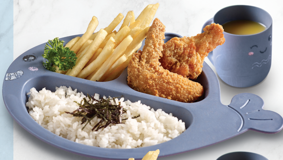
CHICKEN WING & RICE SET