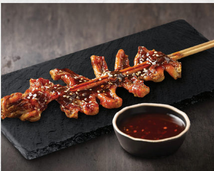
GRILLED SQUID SKEWER (SOY GARLIC / HOT & SPICY) 7.9