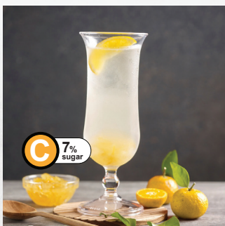
CITRON TEA 4.5