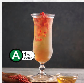
HONEY BERRY ESSENCE 4.5