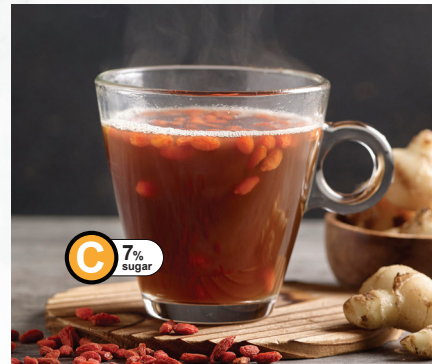
GINGER TEA 3